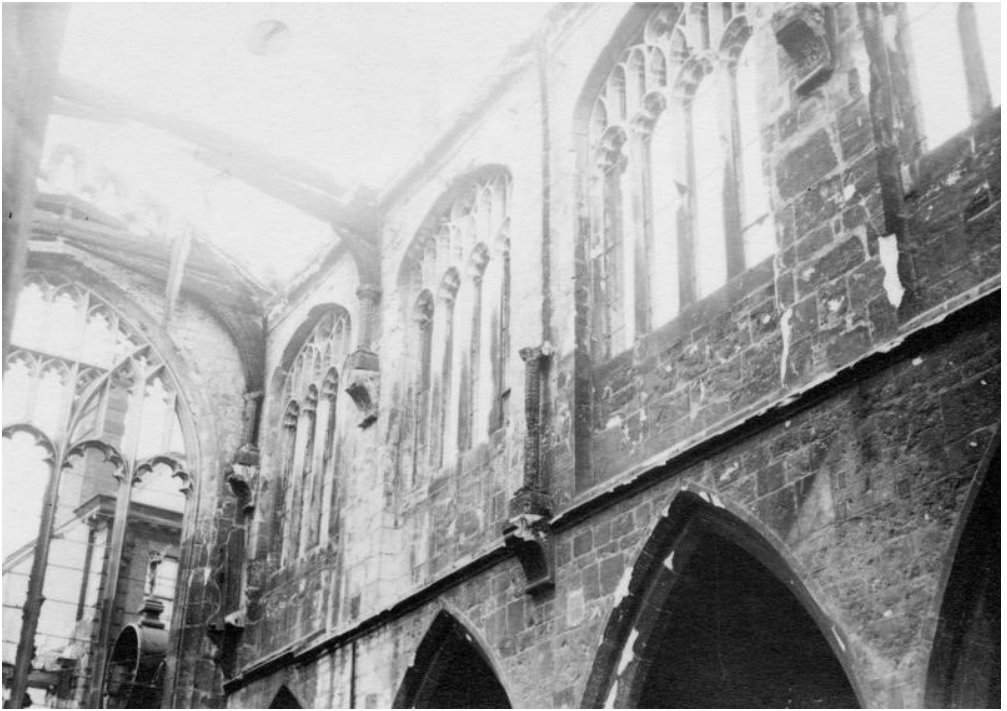
Damage after bombing on Wednesday 29 April 1942